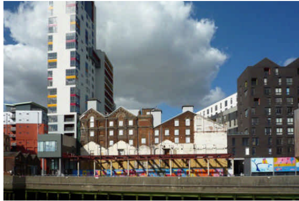
Ipswich Waterfront in September 2012— the location of the granaries painted by John Nash—see cover and page 6