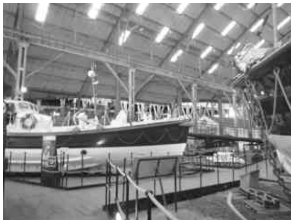
RNLI Lifeboat collection at Chatham Dockyard