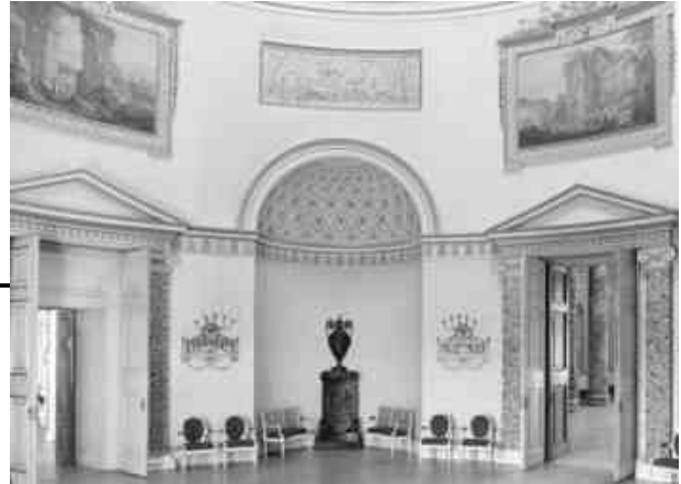
The Saloon, Keddleston Hall

Please use the enclosed form to indicate that you would be interested in joining this trip. You will then be sent the final booking form as soon as it is available.