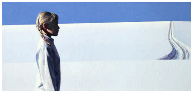
Eyeline by Simon Gales has recently been acquired for the Ipswich Collection see page 17

plus Friends activities and more museum news