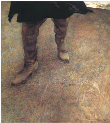
Trodden Weed , 1951 by Andrew Wyeth –see details of Friends Lunchtime Talk on page 14