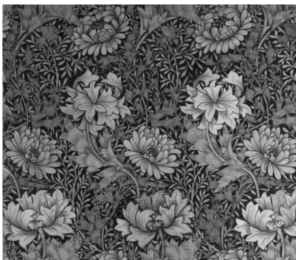
William Morris—Chrysanthemum design

A day trip has been organised to visit two municipal museums on Thursday 24 January 2013. In the morning we visit the newly refurbished William Morris Gallery in Walthamstow. Its